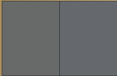
Double page Bleed size: 426 x 291 mm Trim size: 416 x 281 mm