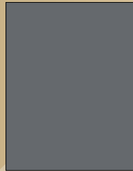
Single page Bleed size: 216 x 291 mm Trim size: 206 x 281 mm